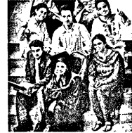
SALARY HIKE IS PASSE, firms offer stock options, deferred entrepreneurship and more

Page 7 International offers on the rise at IIM-A