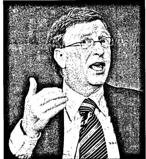
Bill Gates addresses a press conference in New Delhi on Thursday

Union science and technology minister Pawan Kumar Bansal, who was also present at the press conference, described the government's plan to foster partnerships that aim to improve public health. India has worked closely with the Gates Foundation on nutrition and vaccination programmes, Bansal said. The two will now expand their partnership to include agriculture and maternal and child health chal-