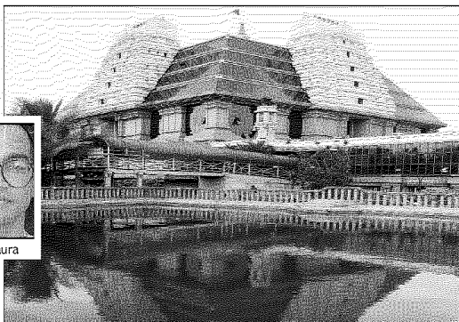
Bangalore Iskcon perhaps has the highest number of IITians working in one city

"In my second year, I took an Art of Living course. The first day of that course was the turning point in my life. The knowledge imparted was profound. I immediately felt my friends and siblings should try it. The course, I felt was a fantastic platform for individual and social growth. I then organized courses myself. Along the way came the realisation that spirituality was a